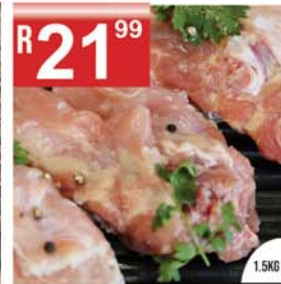
CHICKEN BREAST BONES