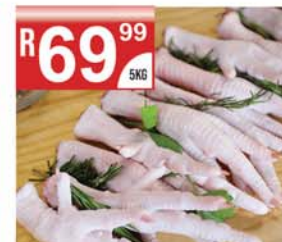
CHICKEN FEET 20+