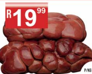
DELI BEEF KIDNEYS