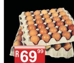
5 DOZEN LARGE EGGS