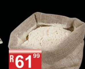
MAIZE MEAL 12.5KG

BOITEKONG: 014 593 4462 - PHOKENG: 014 589 0006