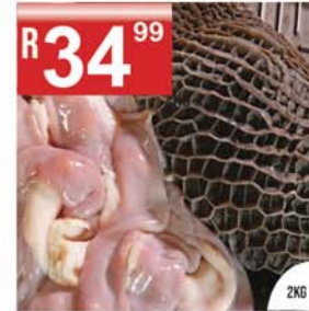
2 WAY TRIPE / DERMS