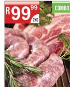
PORK CUTS / WORS