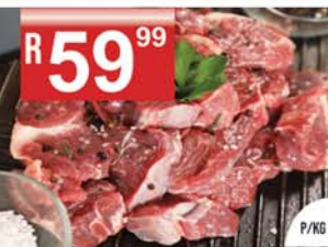
DELI BEEF STEW